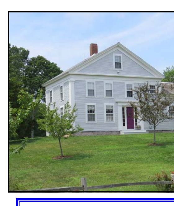
Thank you Volunteers,

Thank you all for your ge volunteer for the Atwood Tour, June 28, 2013. The huge undertaking and wit the challenge for a success Museum.