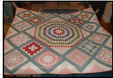
Friendship quilt dated 1848

Approximately 12 quilts will be on display in the Atwood House Museum from September 6 through October 1, 2011. Several examples of Pattern or "Friendship" quilts as well as the silk quilts known as "Crazy Quilts", popularly used as parlor throws during the Victorian age, will be represented. A "Red Work" quilt featuring