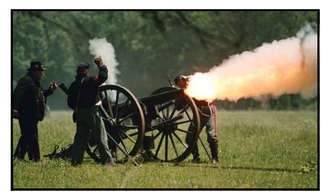
Three photos above show events by Civil War re-enactment groups