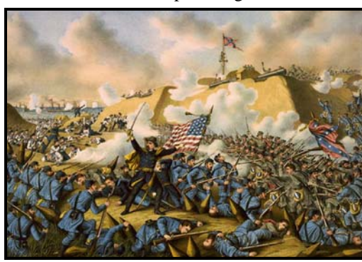
Painting of the Battle of Fort Fisher

scaffolding for the purpose of taking a photograph picture of our camp. An expedition passed our camp this a.m. consisting of the 175th, 168th, 171st Pennsylvania, 158th and 132nd New York, 3rd Massachusetts infantry and two batteries, 1 regiment of cavalry, 16 ambulances, 80 baggage wagons, 20 heads of cattle and 160 mounted infantry. March 14<sup>th</sup> rumored that 500 rebs were march-