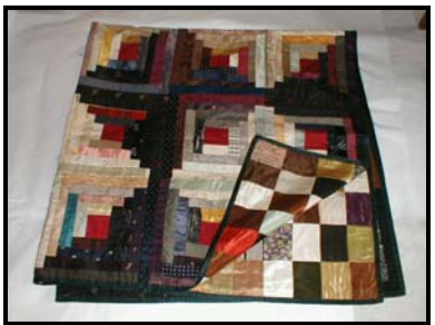
Silk Quilt with Log Cabin Pattern

The Atwood House Museum and the Chatham Historical Society are proud to be the recipients of 29 historic quilts dating from 1833 to 1916. Included in the collection is the bicentennial quilt created by Chatham residents in 1976. These quilts, several of which are signed and dated, document the interpersonal relationships of long time Chatham residents. The signatures inked on