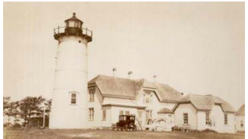
The lighthouse complex in the 1920s

In observance of the closing of the season of celebration, a