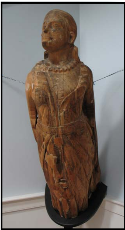
Figurehead in the Atwood House Museum collection from the Barkentine Altamaha

These programs are supported by a grant from the Chatham Cultural Council, a local agency which is supported by the Massachusetts Cultural Council, a state agency.