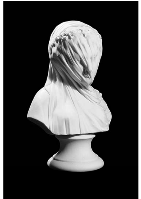
A dramatic bust of a veiled lady. Untitled, some records say it is Rebecca weeping over her children – others, a widow mourning like Victoria.