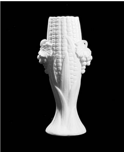
Parian Ware