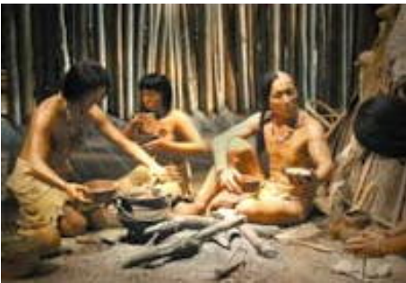
Pequot Museum diorama

The bus leaves to return to Chatham at 2:30 pm. The cost of the trip is $50. The reservation deadline is March 16. Lunch is not included.